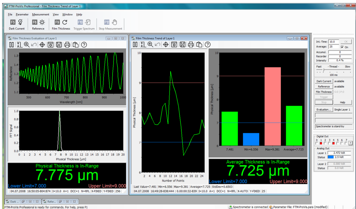
Exemplary screen layout of FTM-ProVis Professional

FTM-ProVis Professional is based on our convenient FTM-ProVis Lite software package and has been extended especially for the needs of in-line film thickness measurement tasks of thin transparent layers using our TranSpec film thickness gauges. The software supports single and 3-axes traverses for scanning thickness profiles on web coating machines. FTM-ProVis Professional reports thickness results and various measurement status information to digital and analog out-ports, by which a closed-loop process control can be achieved. Aside, the software is used for our fiber optics coupled microscope with live camera view, which permits film thickness measurement on very small spots.